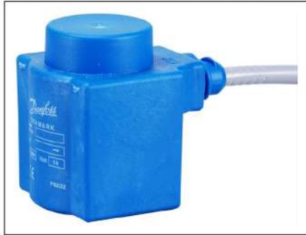
Figure 10: BF, High performance coils