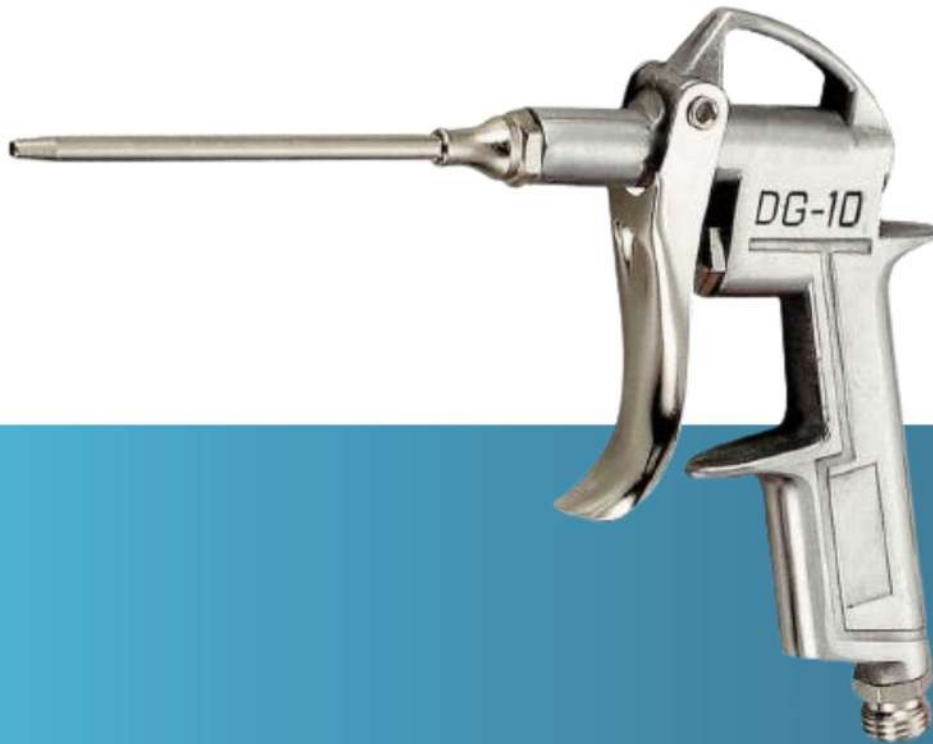
Air Blow Gun – DG-10